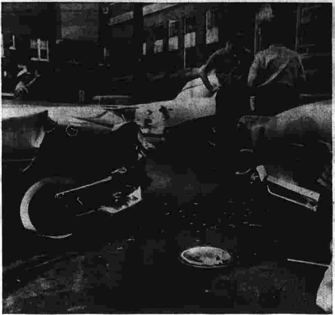
Extensive front end damage resulted in this car in an early morning four-car accident on Main St. opposite the Manchester Post Office. No injuries were reported but an East Hartford youth was arrested, charged with reckless driving.