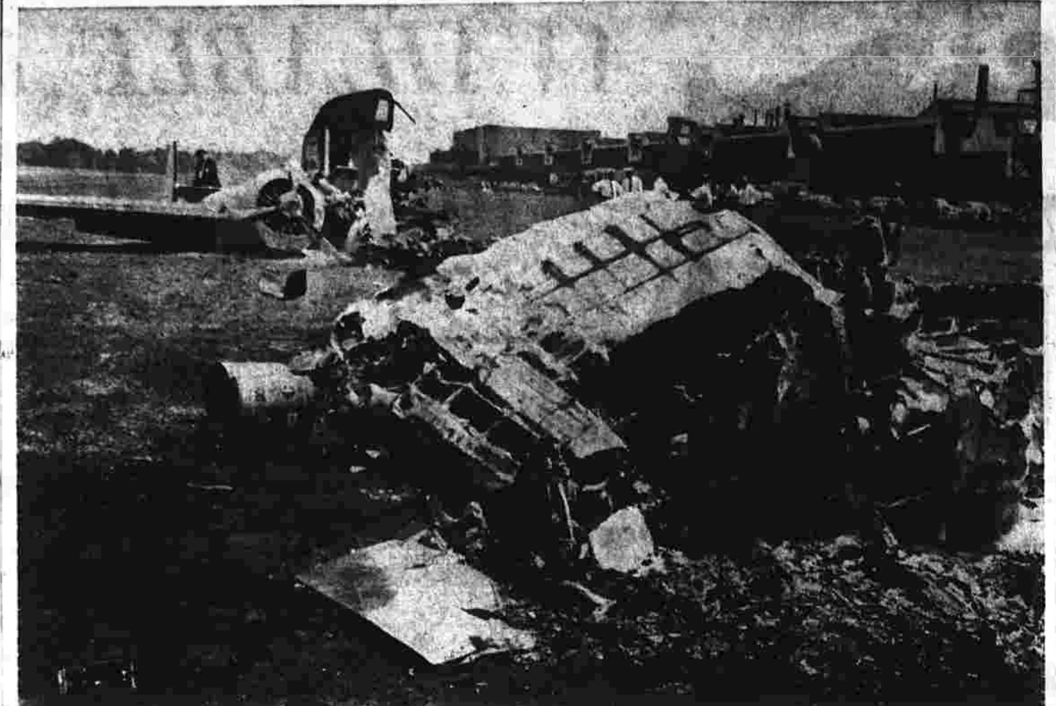
Wreckage of plane which crashed at Rentschler Field, taking the life of the pilot and leaving four others injured.