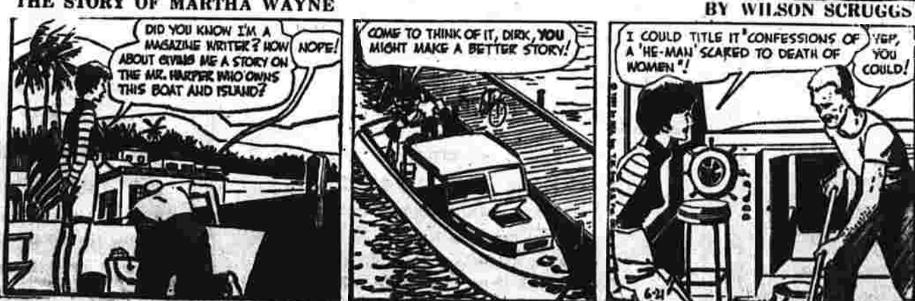
THE STORY OF MARTHA WAYNE